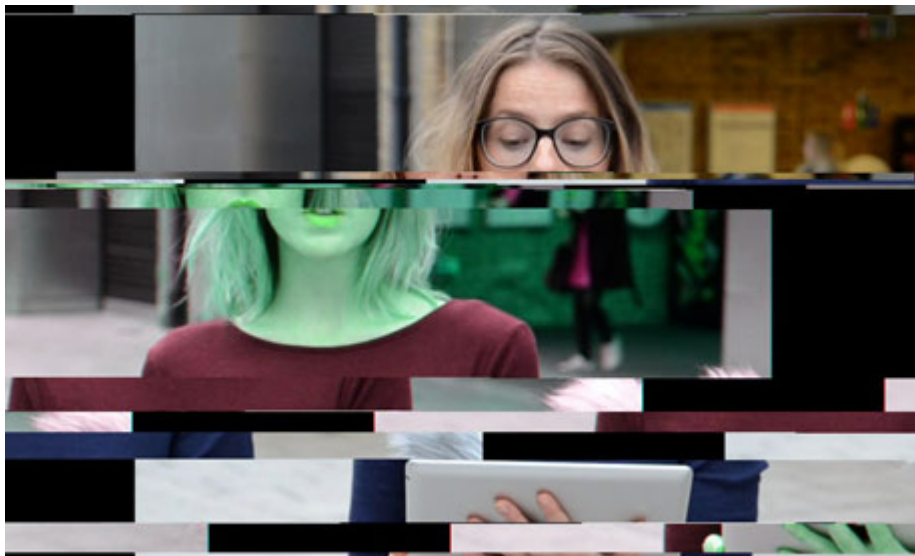
Back to the future ... Still from This content was transmitted to this date in 1987, 2012

The artist's late-night broadcast – in which a woman speaks to viewers in 1987 from 2013 – explores a temporal mystery and may have given some viewers uneasy dreams